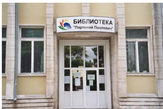
Entrance to the library with its new logo.

The Pavlovich Library just won financing for the project "19 keys to Silistra's past," celebration of the anniversary of 1900 years since the establishment of Silistra. The goal is to promote the most interesting objects of culture and history and the heritage of Silistra. They hope to interest and encourage youth to visit and learn more about these objects and that time in history. Soon to come will be 19 young adult expeditions, and the printing a promotional poster and the 19 post cards of Silistra. On November 1 st the Library staff will officially deliver to 19 of Silstra's citizens the 19 anniversary keys of the town.