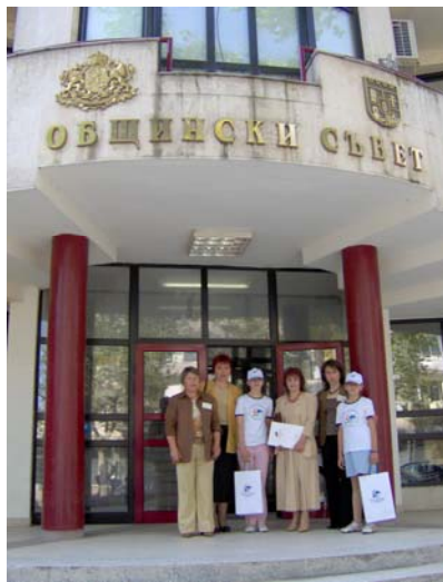
Silistra Library employees prepare to visit the Silistra City Council, carrying items showing the library's new logo.

To publicize the activities, the library printed new bookmarks, published a newsletter “Durostotrum – Durstar – Silistra” (recognizing the various names of the town), and published a bibliography “Partenii Pavlovich” during National Library Week. There were 27 publications of the Library in local newspapers and 4 participations in radio transmissions.