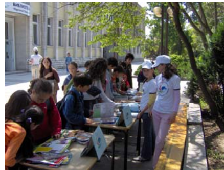
Library teen volunteers distribute literature in front of the library.